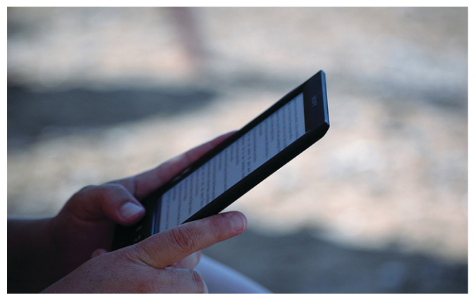
eBooks and eAudiobooks dkpl.org/e-books/

The library offers free downloadable eBooks and eAudiobooks to its patrons through several different services. OMNI offers a large selection of popular fiction and nonfiction titles. RBdigital offers a collection of eAudiobooks.